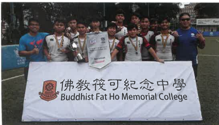
All Hong Kong Inter-School Rugby Sevens Competition (Boys A Grade) 2016-2017 Cup 1st Runner up (All HK 2nd place)