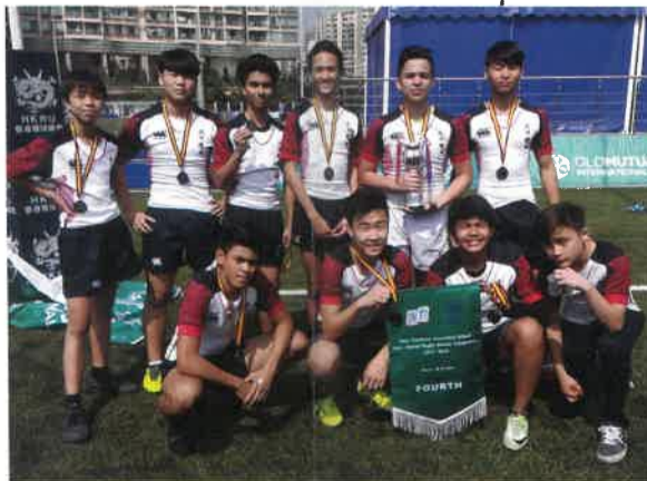
New Territories Secondary School (Boys B Grade) Inter-school Rugby Sevens 2017-2018, Cup 4th Runner up, New Territories 4th place