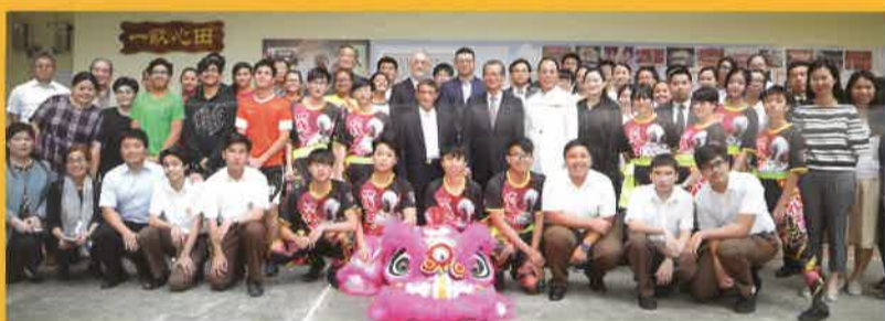
THE VISIT OF THE FINANCIAL SECRETARY OF HKSAR GOVERNMENT MR PAUL CHAN MO-PO TO BFHMC ON 20 APRIL 2018.