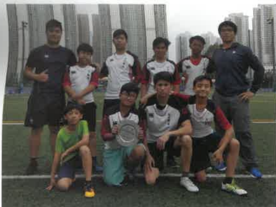
New Territories Secondary School (Boys C Grade) Inter-school Rugby Sevens 2017-2018, Plate Champion