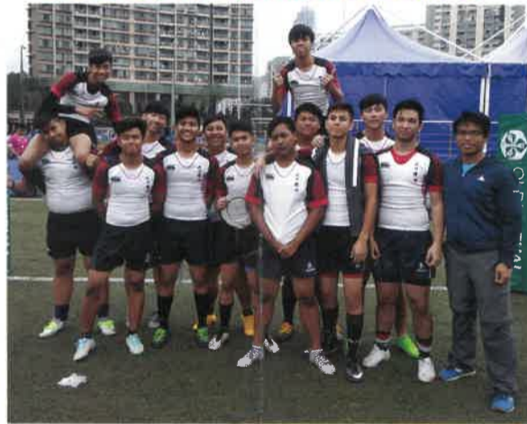
New Territories Secondary School (Boys A Grade) Inter-school Rugby Sevens 2017-2018, Plate Champion