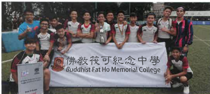
All Hong Kong Inter-School Rugby Sevens Competition (Boys B Grade) 2016-2017 Cup 1st Runner up (All HK 2nd place)